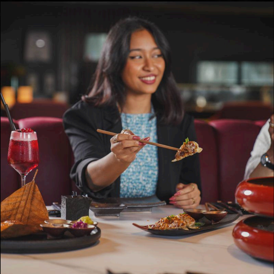
WARM AND INVITING ATMOSPHERE