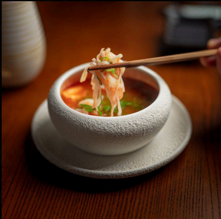
MODERN JAPANESE CULINARY